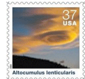
Altopcumulus Lenticularis Near Nederland, CO Sept 1998, sunset