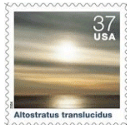
Altostratus Translucidus Cape May, NJ Dec 26, 1988 around 3 PM