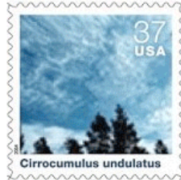
Cirrocumulus Undulatus Coal Creek Canyon, CO Sept 16, 1992 around noon