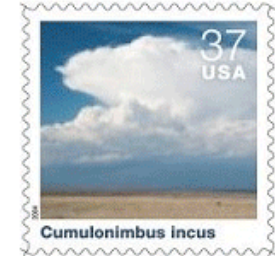
Cumulonimbus Incus W of Amarillo, TX April 22, 1994 around 4 PM