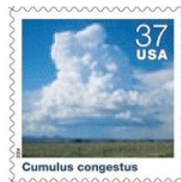
Cumulus Congestus N of Douglas, AZ August 28, 2000, 5:00 PM