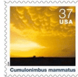
Cumulonimbus Mammatus Near Barnes, KS June 6, 1971 8:51 PM