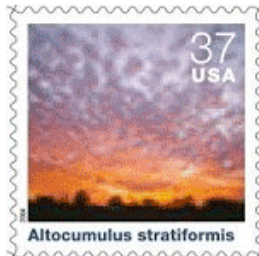
Altopcumulus Stratiformis Near Las Cruces, NM December 1988, sunset