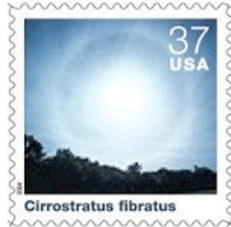
Cirrostratus Fibratus NE of Duluth, MN June 26, 1988