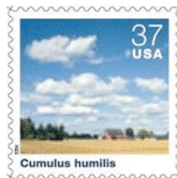
Cumulus Humilis Near McMinnville, OR August, midafternoon