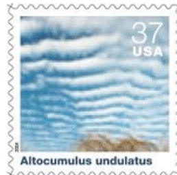
Altopcumulus Undulatus Rockville, MD Mid 1990s, May, 10 AM