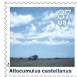
Altopcumulus Castellanus 40 miles ESE of Wichita, KS July 3, 1992, 11:00 AM