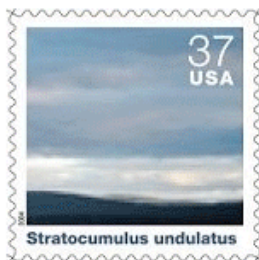
Stratocumulus Undulatus Muddy Bay, Labrador October 5, 1977, sunset