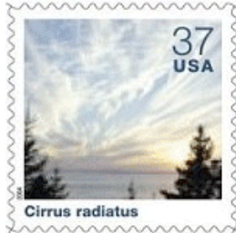
Cirrus Radiatus Blue Hill Bay, ME July 1981, early evening