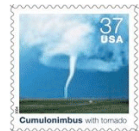
Cumulonimbus with Tornado near Osabrock, ND July 25, 1978, 6:00 PM