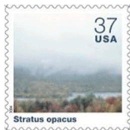
Stratus Opacus Chittenden Reservoir, VT October 3, 1987, 2:30 PM